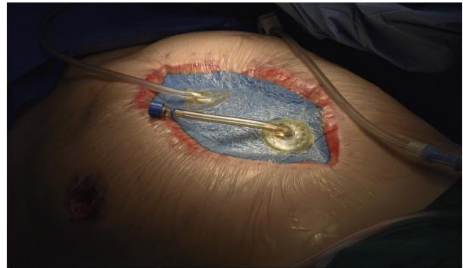
Figure [1]: VAC dressing- black sponge was fitted in the defect with sealing dressing