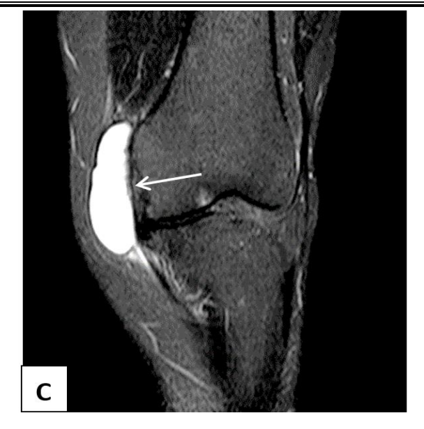
Figure [4]: Ultrasound [A] and MRI [B and C] images of a 50 years old male, showing horizontal degenerative tear of the PHMM, with medial collateral bursa