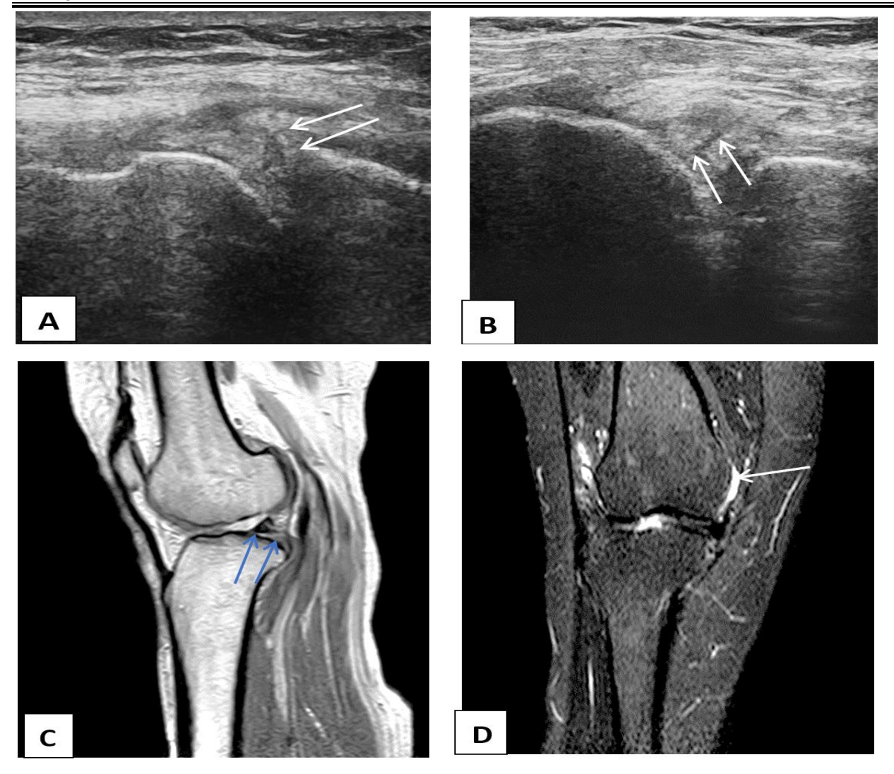
Figure [3]: Ultrasound and MRI examinations of the right knee showing grade III meniscal tear of PHLM [flap tear/ fish mouth tear], with mild joint effusion