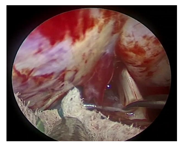
Figure [2]: Intraoperative view of EMVD

situation such as [e.g., pain relief, [CSF] leakage, intracranial infection, cerebral hemorrhage, and neurological deficits].