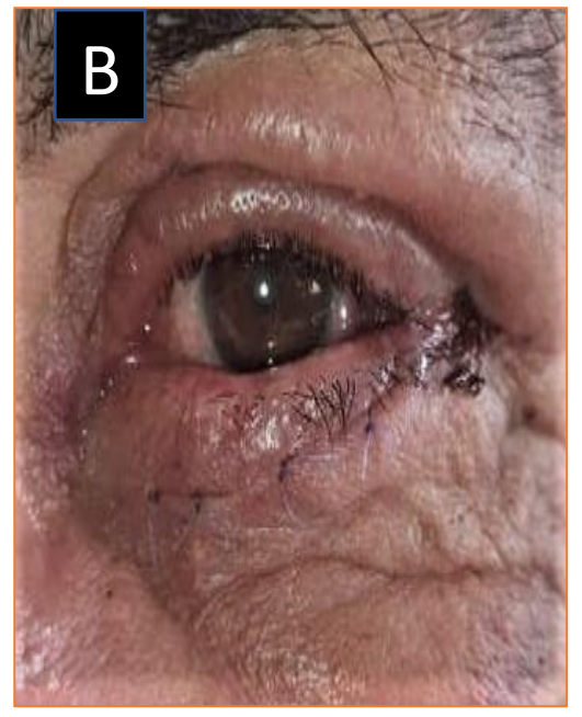
Figure [2]: shows A case of unilateral involutional ectropion A. preoperative. B. 2 weeks post surgical repair by a lateral tarsal strip