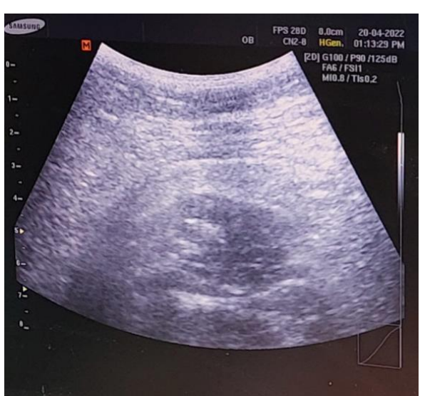
Figure [1]: identification, anesthetic injection of QL

Using needle advancement and hydrodissection [starting near the xiphoid and costal margin], the needle was passed between rectus abdominis sheath and the transversus abdominis. It was then directed beneath the aponeurosis of the linea semilunaris and passed through the fascial layer of the internal abdominis and transversus abdominis muscles toward the anterior portion of the iliac crest. 6- to 7-mL volume of solution was required for the hydrodissection in the TAP medial to the semilunaris. The remainder of the volume was used to hydrodissect the planes between internal abdominis and transversus abdominis.