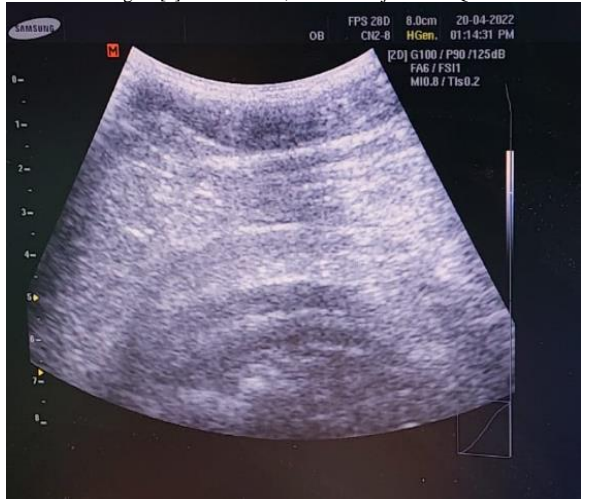
Figure [2]: Identification of the anterior abdominal wall muscles.